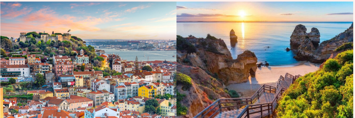
Left: Lisbon. Right: Faro.

Of course, Portugal is much more than a nice spot to get a tan. Our culture, greatly influenced by a long history of maritime exploration, is just as appealing. Many of the traditions that identify Portugal are well preserved in our literature, music and gastronomy. Speaking of which, who doesn't like to eat?! In Portugal, you get to enjoy some incredible dishes. At the heart of many of them is codfish ("bacalhau"). To enrich the experience of a traditional Portuguese meal you have our prime quality olive oil, several unique cheeses and, of course, the Portuguese wine. While Porto wine is a widely known example, the whole country produces a great variety of wines, identified by the well-defined regions from which these wines come.