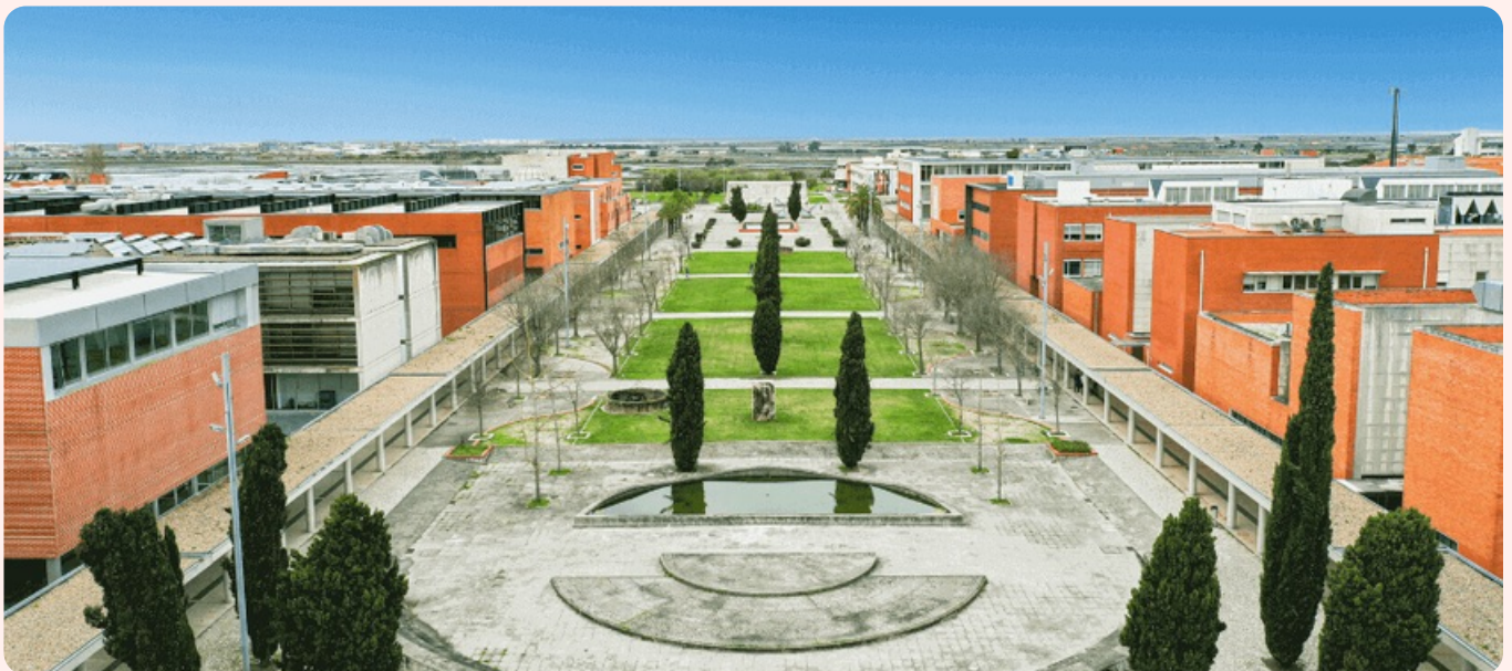
Universidade de Aveiro

Almost synonymous with the city itself is the University of Aveiro . Founded in 1973, beginning mostly with engineering courses, it quickly became one of the most dynamic and innovative universities in Portugal. Some of its buildings were designed by famous Portuguese architects.