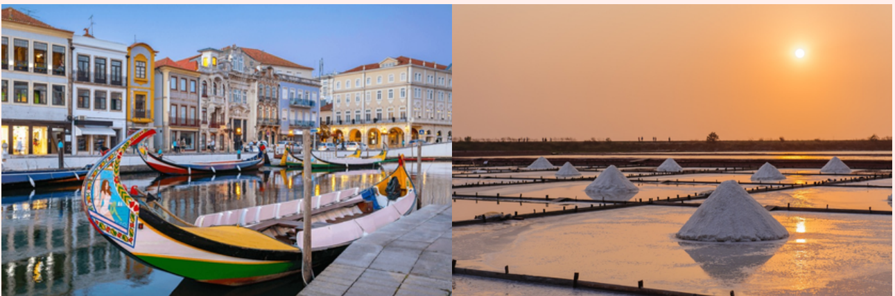
Left: Moliceiros . Right: Salinas .

Also known as the Portuguese Venice, the city of Aveiro is full of canals, bridges, and painted boats called “ moliceiros ”. These boats were used to remove the excess vegetation in the canals and to carry animals and goods. Nowadays they are a picturesque way to go sightseeing. Due to its proximity to the sea, Aveiro has relied on economic activities related to it, such as salt production. Many salt beds are now used for fish farming.