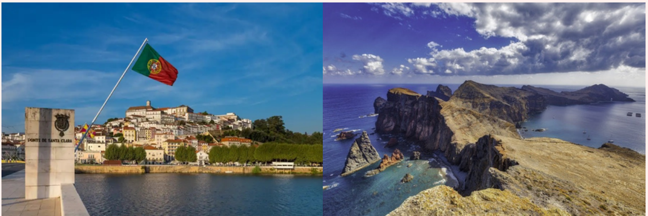
Left: Portuguese Flaf. Right: Madeira Island.

Portugal is a nation in south-western Europe, in the west of the Iberian Peninsula. To the north and east, it is bordered by Spain and to the south and west by the Atlantic Ocean. The Azores (Açores) and the Madeira islands, both located in this ocean, are the autonomous regions of Portugal. The Portuguese population is around 10.3 million people and the capital of Portugal is Lisbon. Its other important cities are Porto, Coimbra, Braga, Aveiro, Faro, Funchal, and Ponta Delgada.